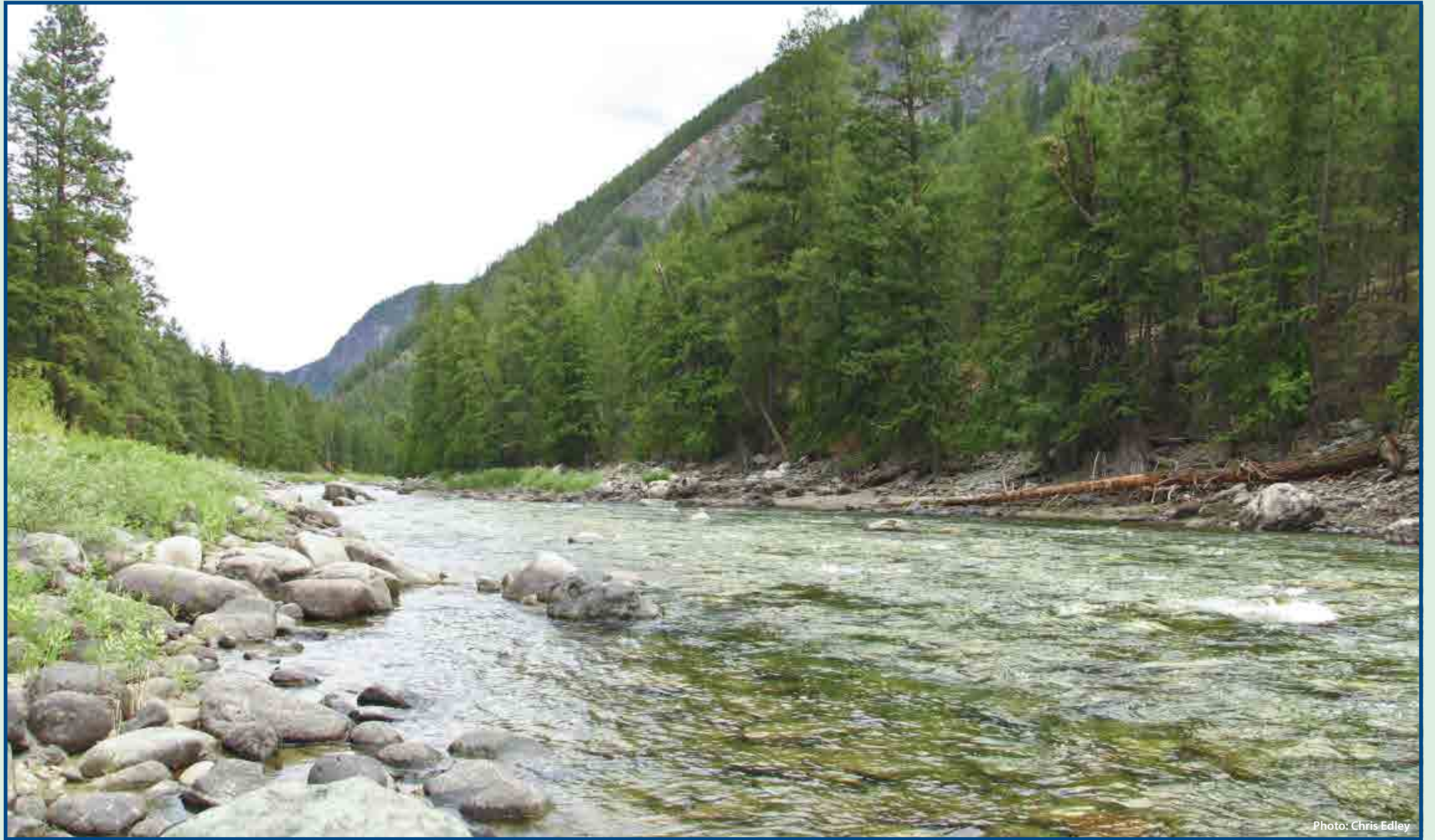
The rocky shoreline of the Similkameen River at Stemwinder Provincial Park is a popular fishing spot and a great place to cool your feet on a hot summer day.